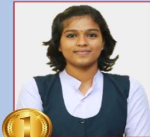
GADHA M S (97%)

37 students appeared for the exam, 11 students brought laurels to the institution by bagging 90% and above