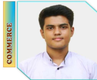
SARANG S S (93.2%)